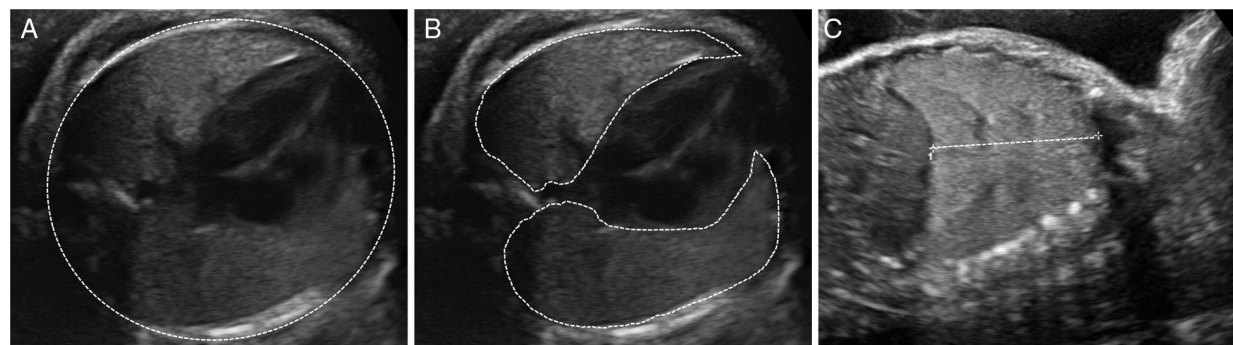
Figure 1. Ultrasound images demonstrating the measurement of the thoracic circumference (A), lung area (B), and lung length (C). Lung volume was calculated from lung area and lung length.

Baseline characteristics for the 447 subjects are given in Table 1. Except for a higher educational level, the women included in this study did not differ from the total PreventADALL study group (Table 1). Nicotine use during pregnancy was low; of the 56 users, 54 stopped when recognizing their pregnancy. The mean GA at ultrasound examination was 30.0 weeks (SD 0.50), ranging from 28.9 to 31.3 weeks.